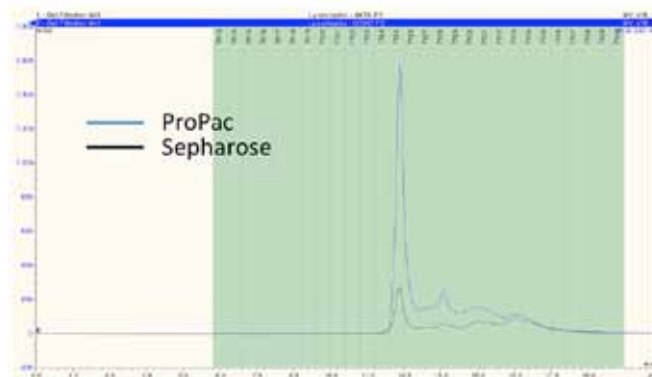
Figure 3. Gel filtration analysis of lysostaphin from ProPac and Sepharose IMAC columns. 50 mM \text{PO}_4 , 100 mM NaCl, pH 7.0 with a flow rate of 0.25 mL/min, 30 \mu\text{L} of the collected fractions injected, UV detection at 280 nm.

The collected lysostaphin protein fractions contained 9.5 mg of the purified recombinant protein in an 8 mL elution buffer. A duplicate sample was applied to a Chelating Sepharose Fast Flow IMAC column and collected a similar amount of protein in a 50 mL elution buffer. The two methods produced similar purification results as shown by the amount of protein collected and the subsequent analysis by gel filtration (Figure 3).