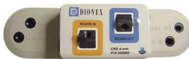
Figure 1. Carbonate Removal Device.

Typically, the CRD (for theory and operation, see the CRD manual and Technical Note 62) 2 is used to remove the carbonate peak from the sample just prior to detection, and it would be installed after the suppressor and before the detector. In this application update, the CRD is used as a sample preparation device to remove carbonate from the colas during injection; therefore it is installed between the AS40 Autosampler and the injection valve. Hydrate the 4-mm CRD according to the QuickStart Instructions. 7 Because the CRD is a membrane-based device, high pressure can irreversibly damage it. Always remove all plugs from the CRD before hydrating it or installing any tubing. Replace the PEEK injection tubing on the bleed valve of the AS40 Autosampler with a ~50-cm (18-in.) piece of orange PEEK (0.51-mm or 0.02-in. i.d.) tubing. Install the free end into the "Eluent In" port of the 4-mm CRD. Cut another ~20-cm (8-in.) piece of orange PEEK and install one end into the "Eluent Out" port of the CRD and the other end into Port 5 of the injection valve. Connect the regenerant waste line (1.6-mm or 0.063-in. i.d. Teflon) from the degas module to the "Regen In" port of the CRD. Connect one end of another length of Teflon tubing into the "Regen Out" port of the CRD and direct the other end to waste. The CRD is designed to slip over the top of the suppressor. The CRD can be positioned either outside the ICS-2000 system or secured on the ASRS ULTRA II suppressor according to Figure 1. 8