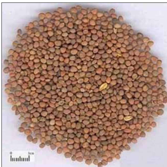
Figure 1. Semen Raphani.

The calculated peak purity match factor for sinapine thiocyanate separated from the Semen Raphani extract is 950 (the corresponding value for 100% purity is 1000). These results demonstrate that the Acclaim Phenyl-1 column provides good selectivity and is suitable for analysis of sinapine thiocyanate.